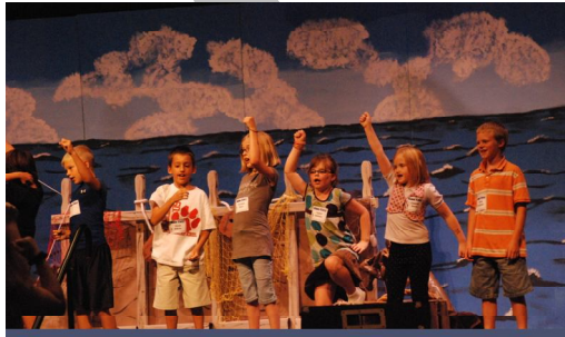
"The Gathering" Worship Vacation Bible School Fellowship Dinners

Community Groups Red Cross Blood Drive Emergency Shelter Board of Elections UMC District Conference Events Partnership with Grace Church