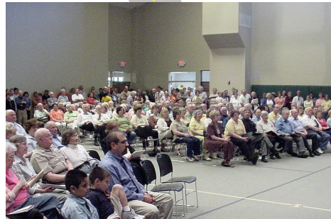
Nativity Festival Fontanini Display Weekly Youth Ministry Combined Choir Events

Community Groups Red Cross Blood Drive Emergency Shelter Board of Elections UMC District Conference Events Partnership with Grace Church