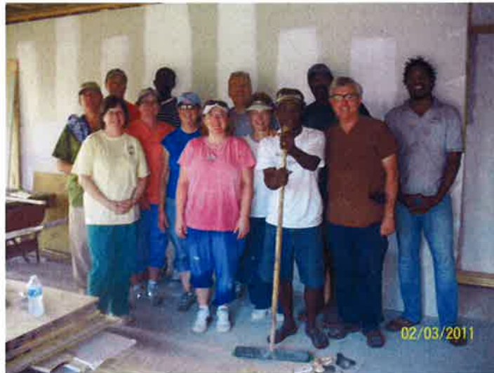
2011 Mission Trip Participants with others from the Bahamas